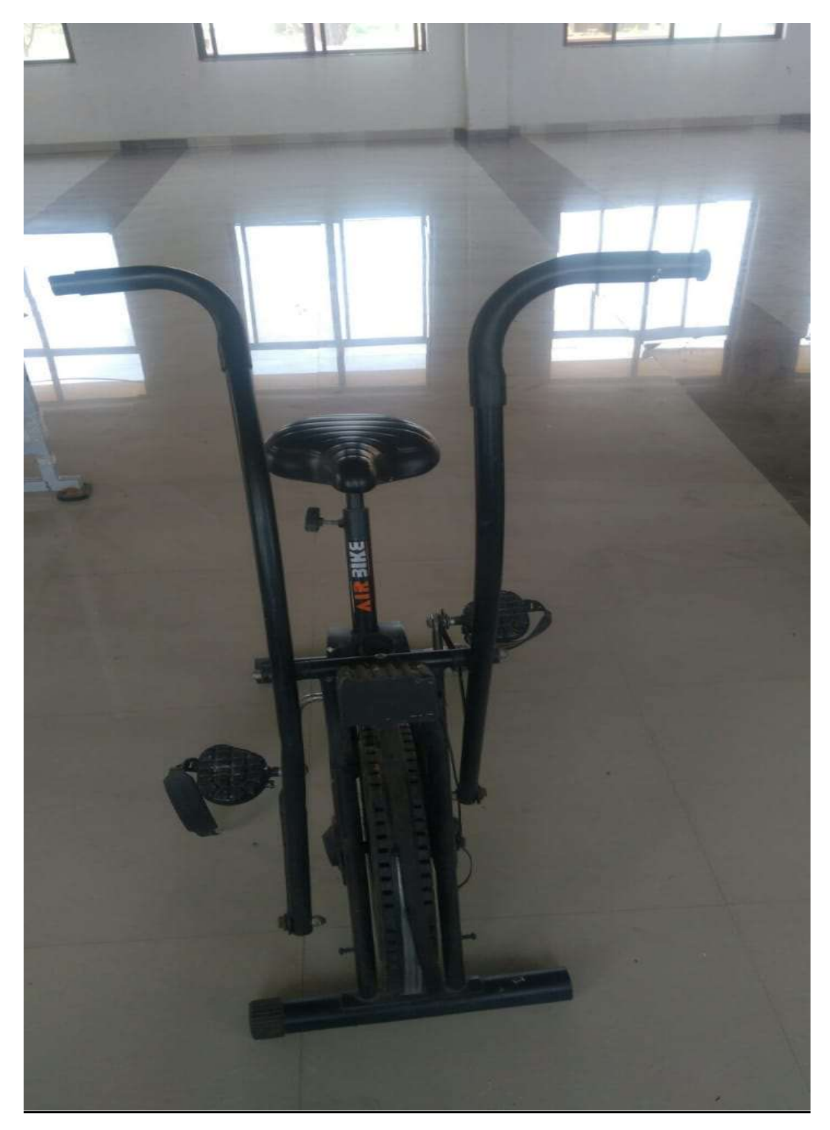
<u> Stationery Bike – Air Bike Benson</u>