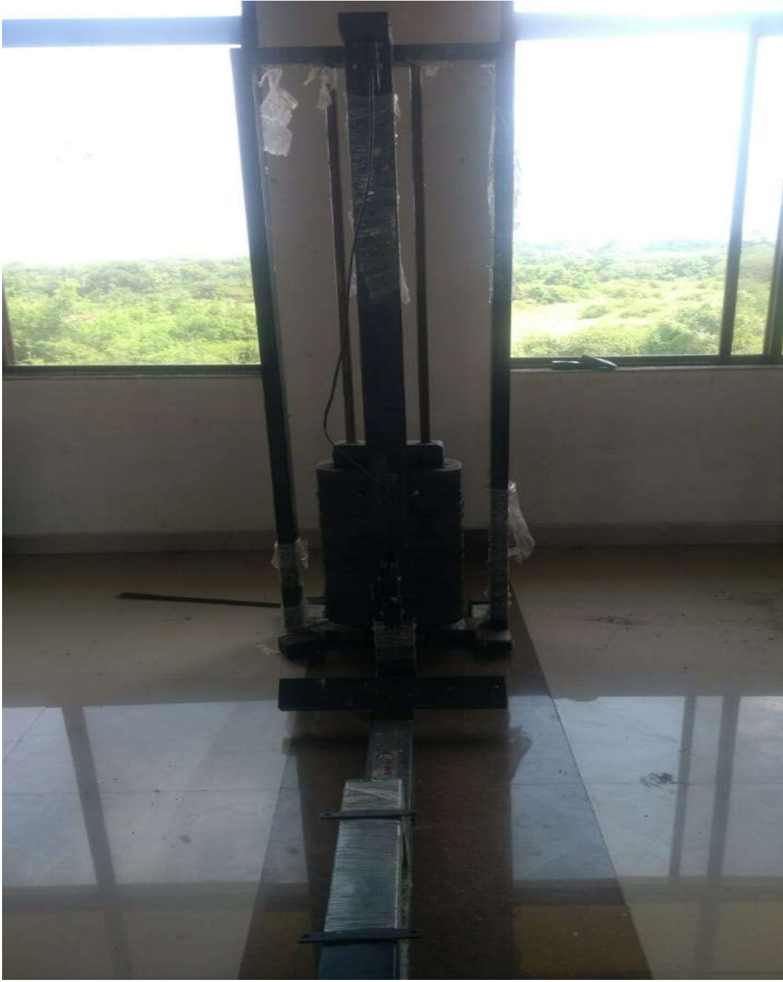
Seated Rover 75kg