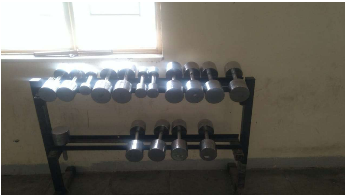
Dumbbells With rack