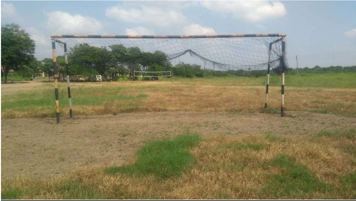
Football Goal Post