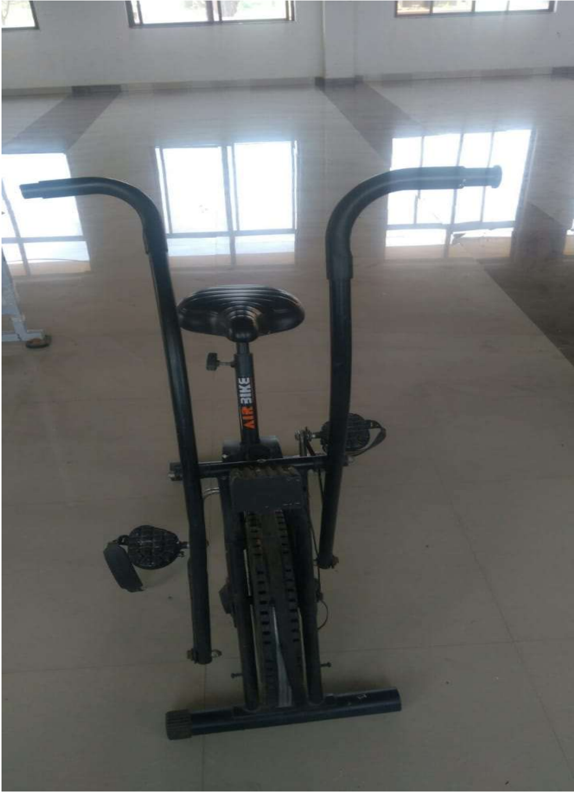
Stationery Bike –Air Bike Benson