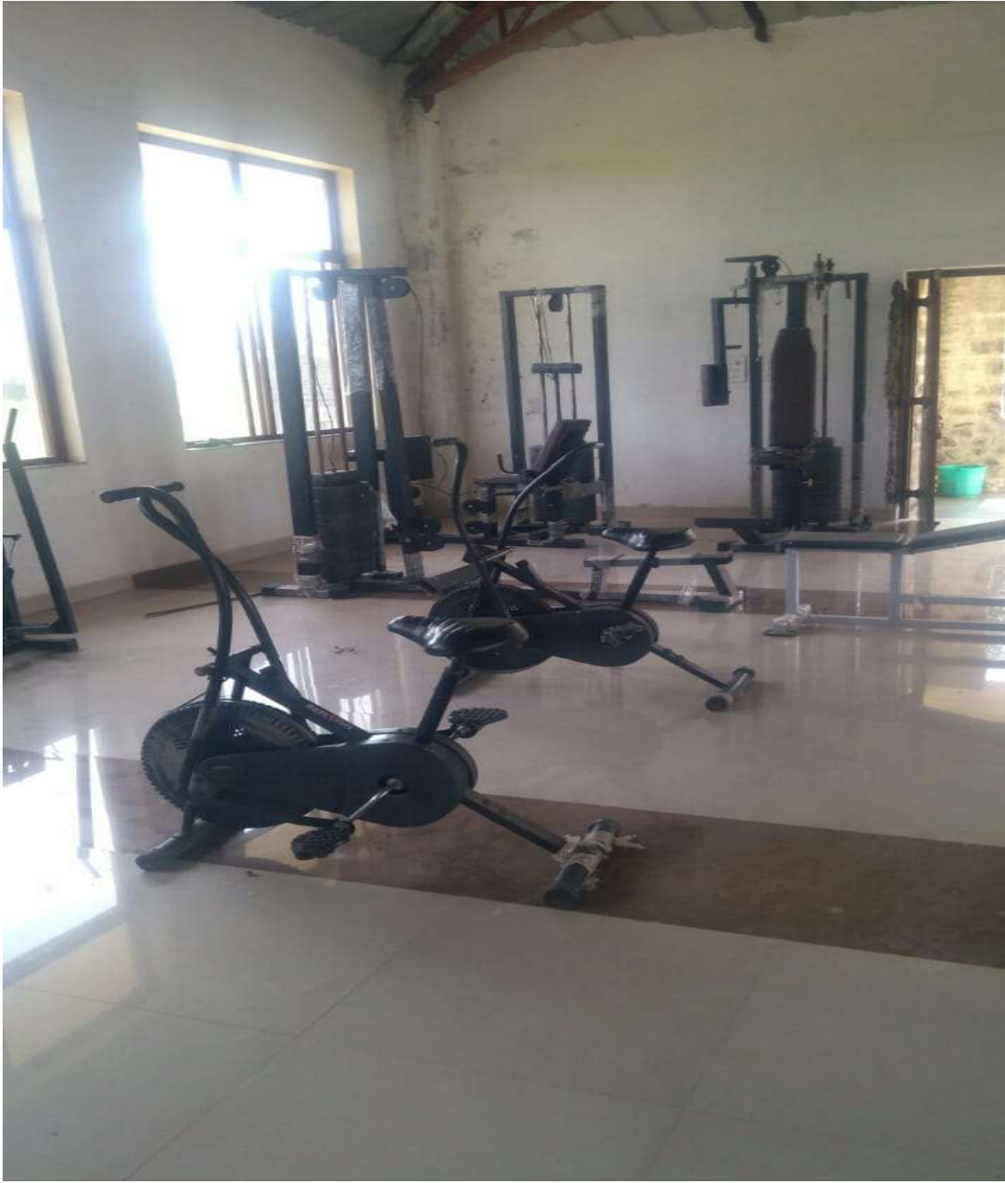
Multi Gym Hall (Girls)