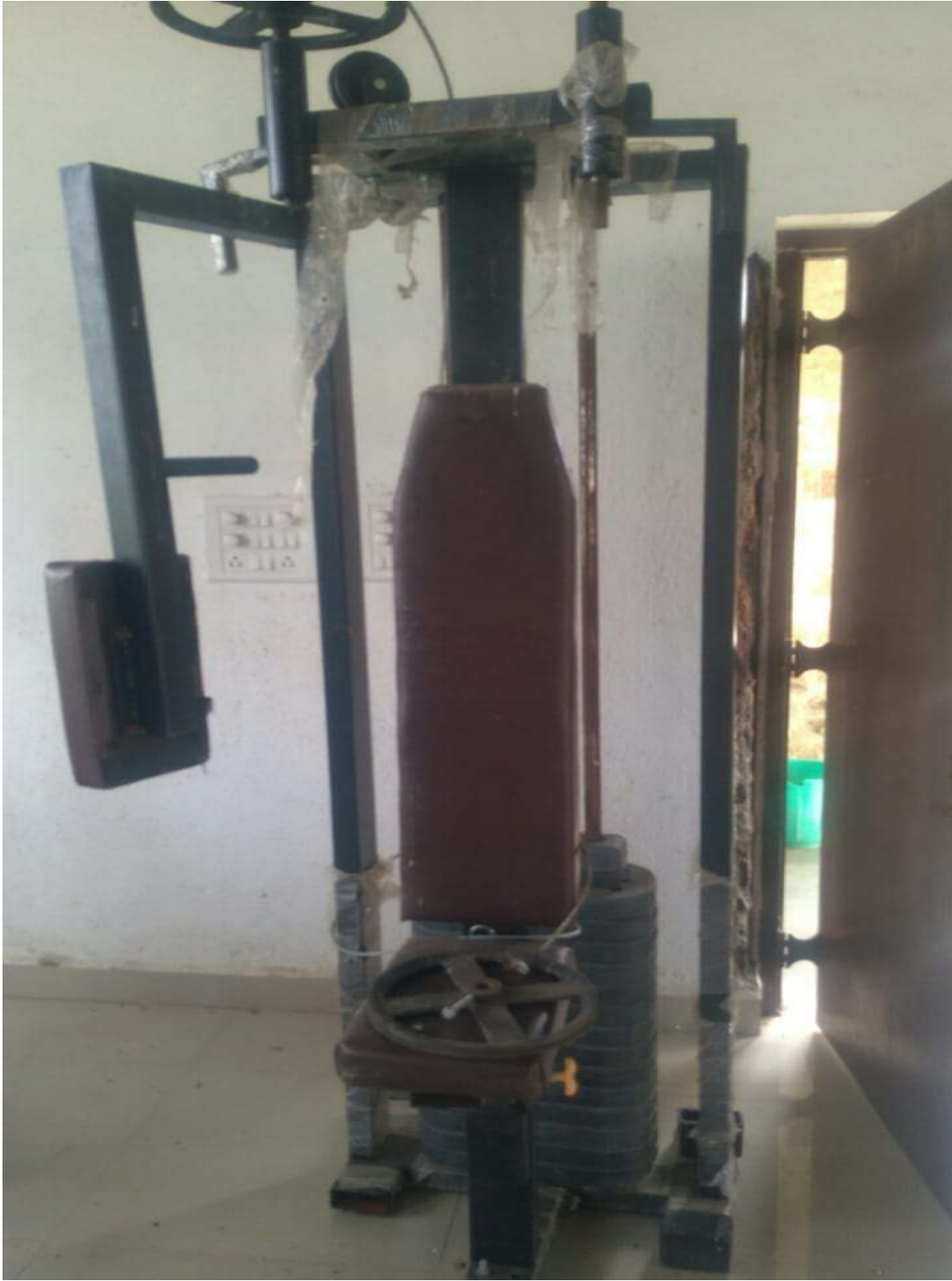
Shoulder Press Machine