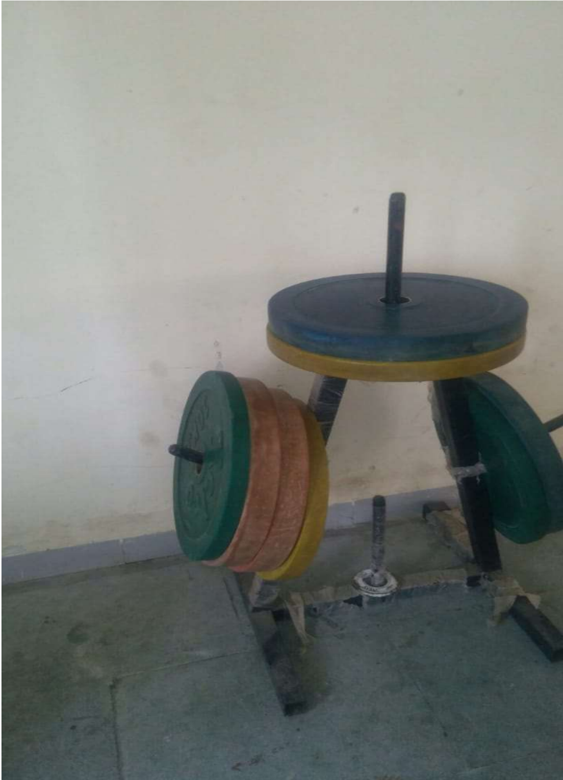
Weght Lifting Plate with Stand