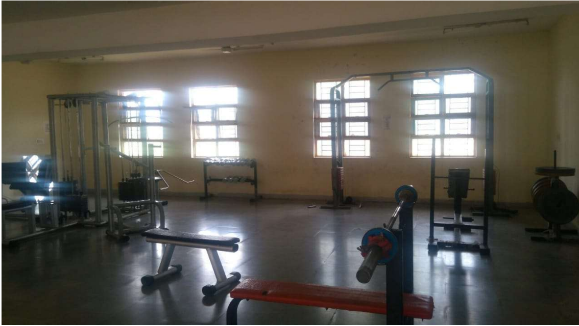
Multi Gym Hall (Boys)