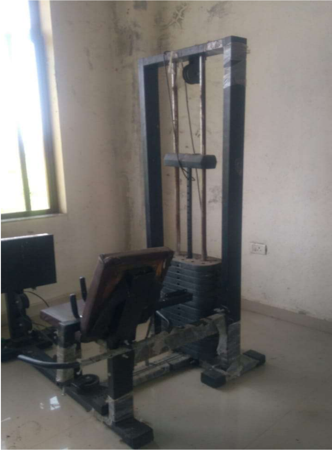
Leg Press Machine